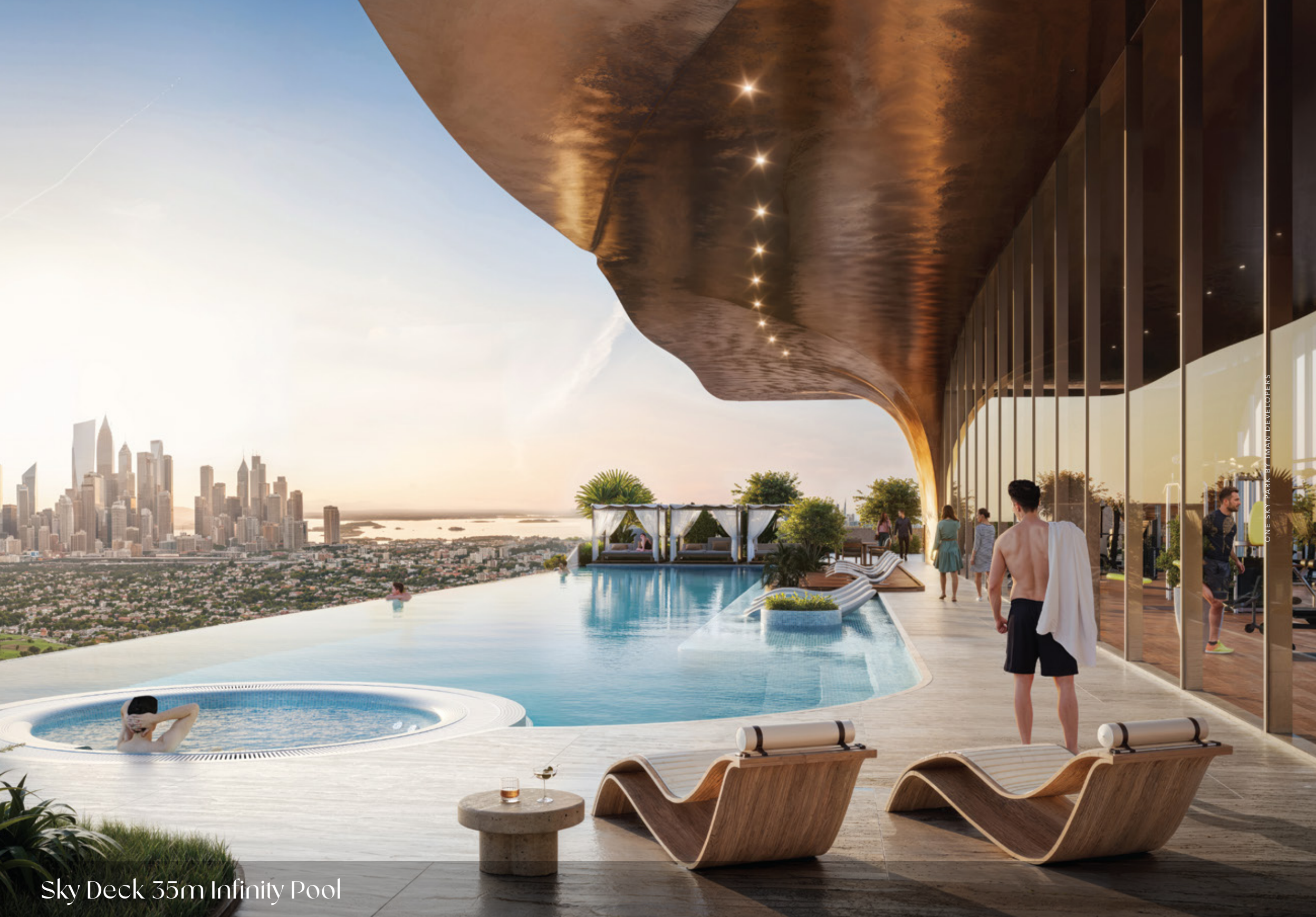
Sky Deck 35m Infinity Pool