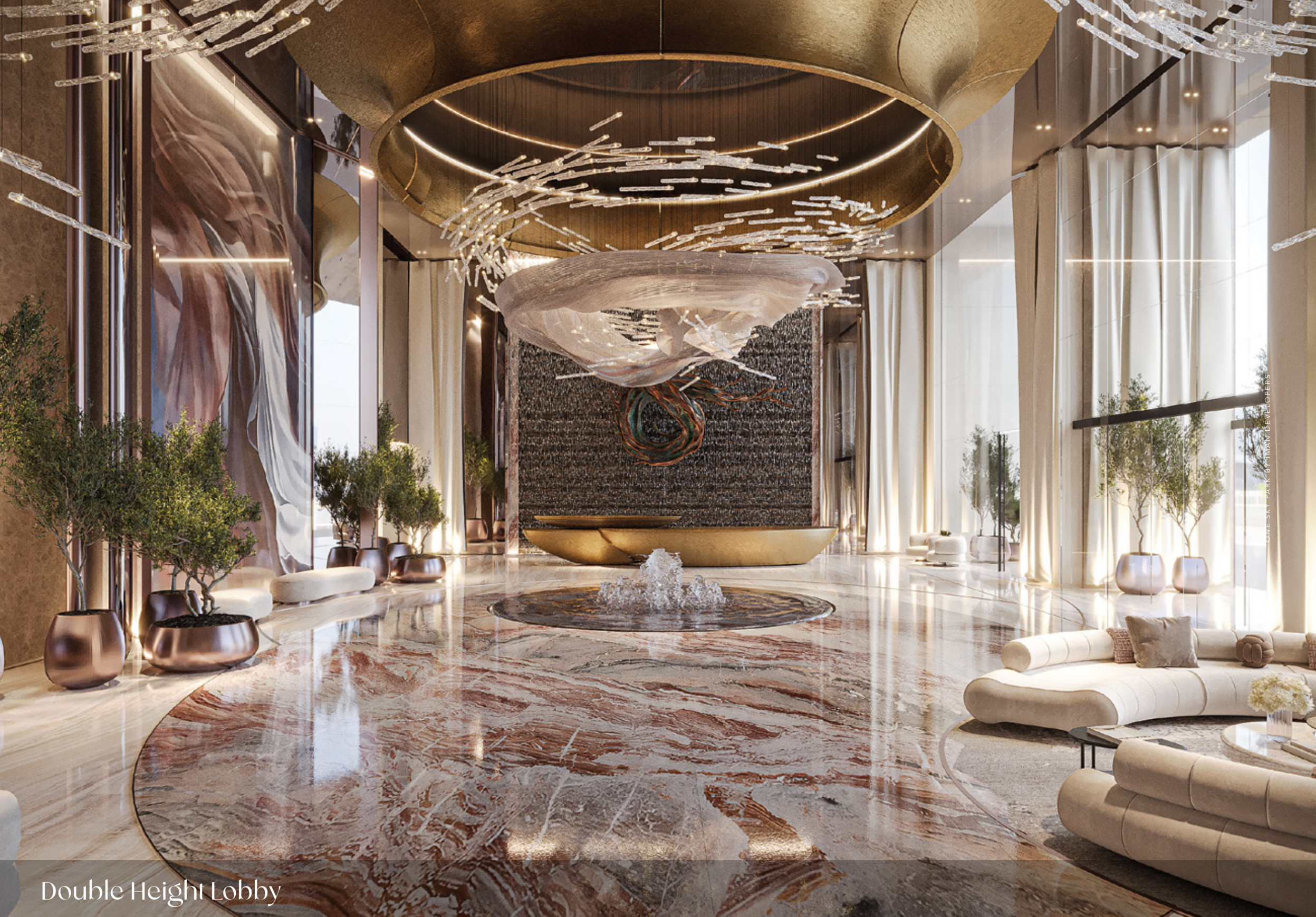
Double Height Lobby