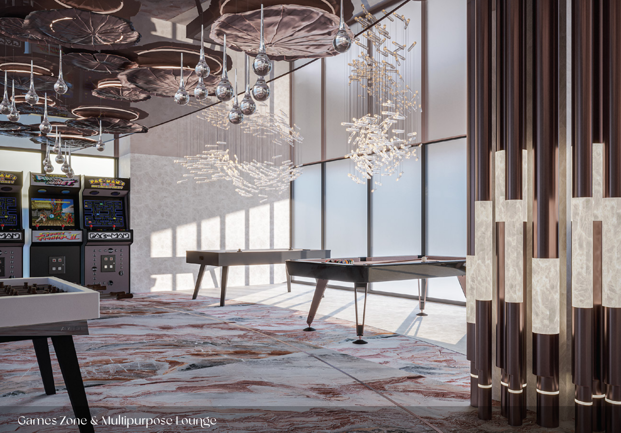
Games Zone & Multipurpose Lounge