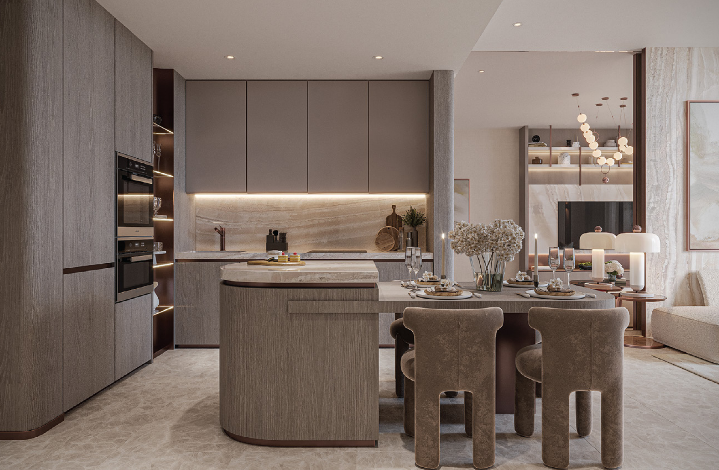
Kitchen & Dining With Branded Appliances