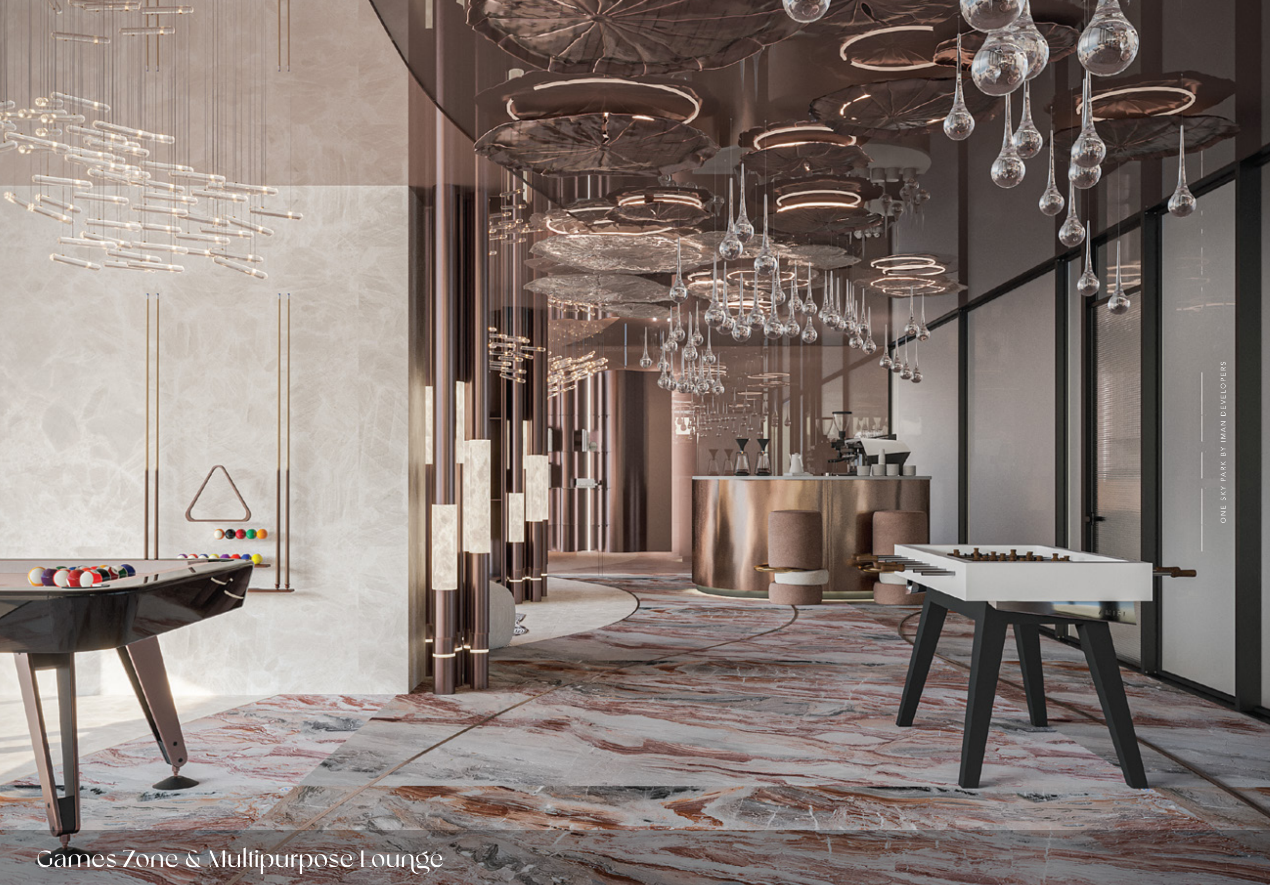
Games Zone & Multipurpose Lounge