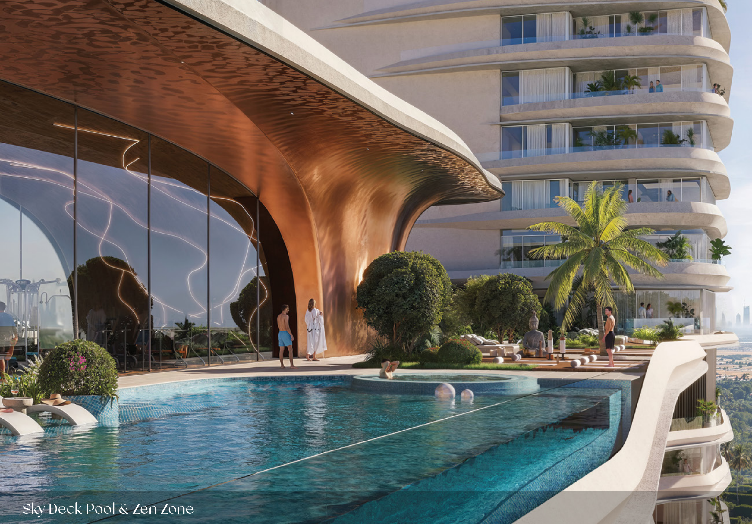
Sky Deck Pool & Zen Zone