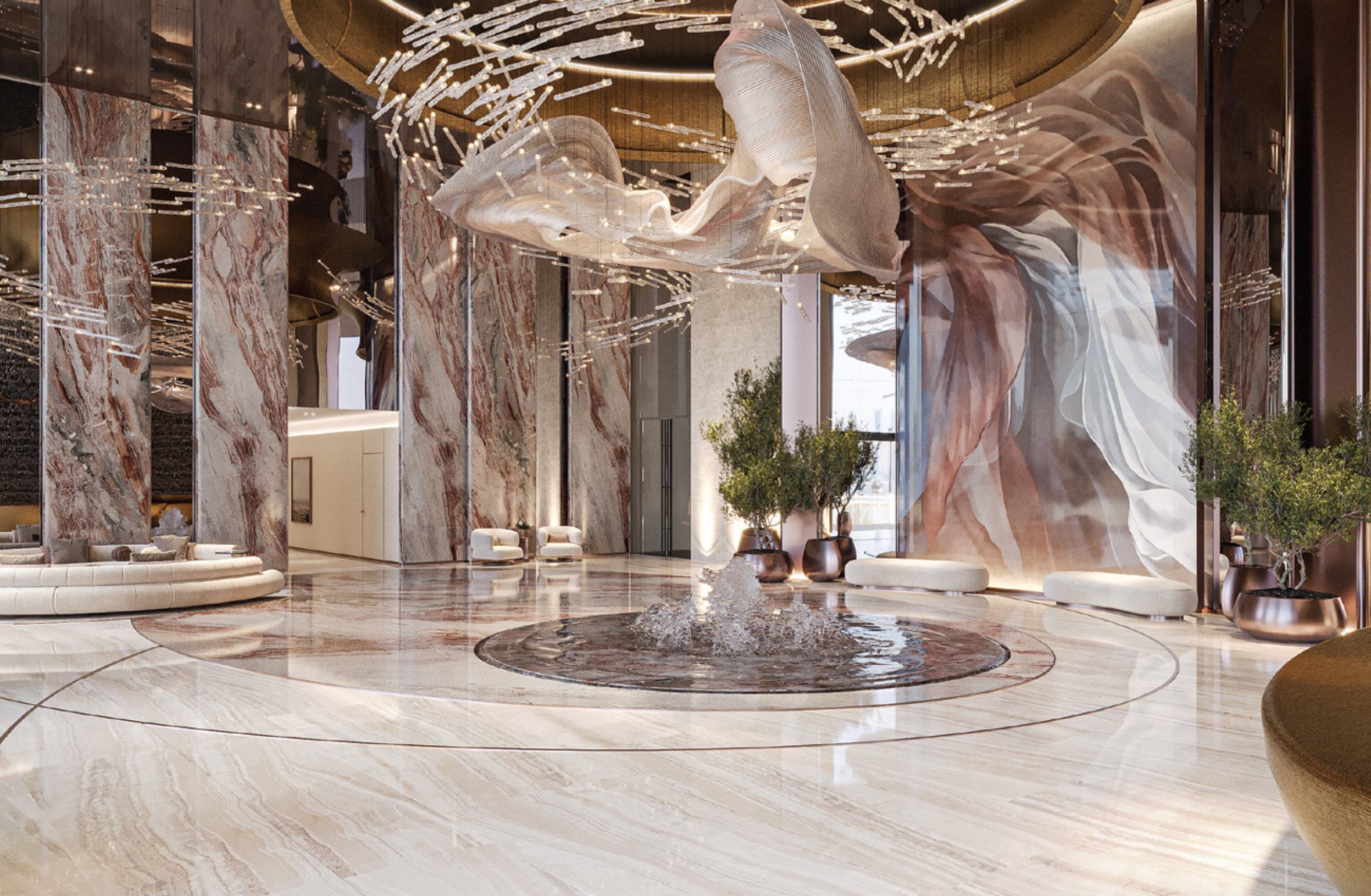
Double Height Lobby