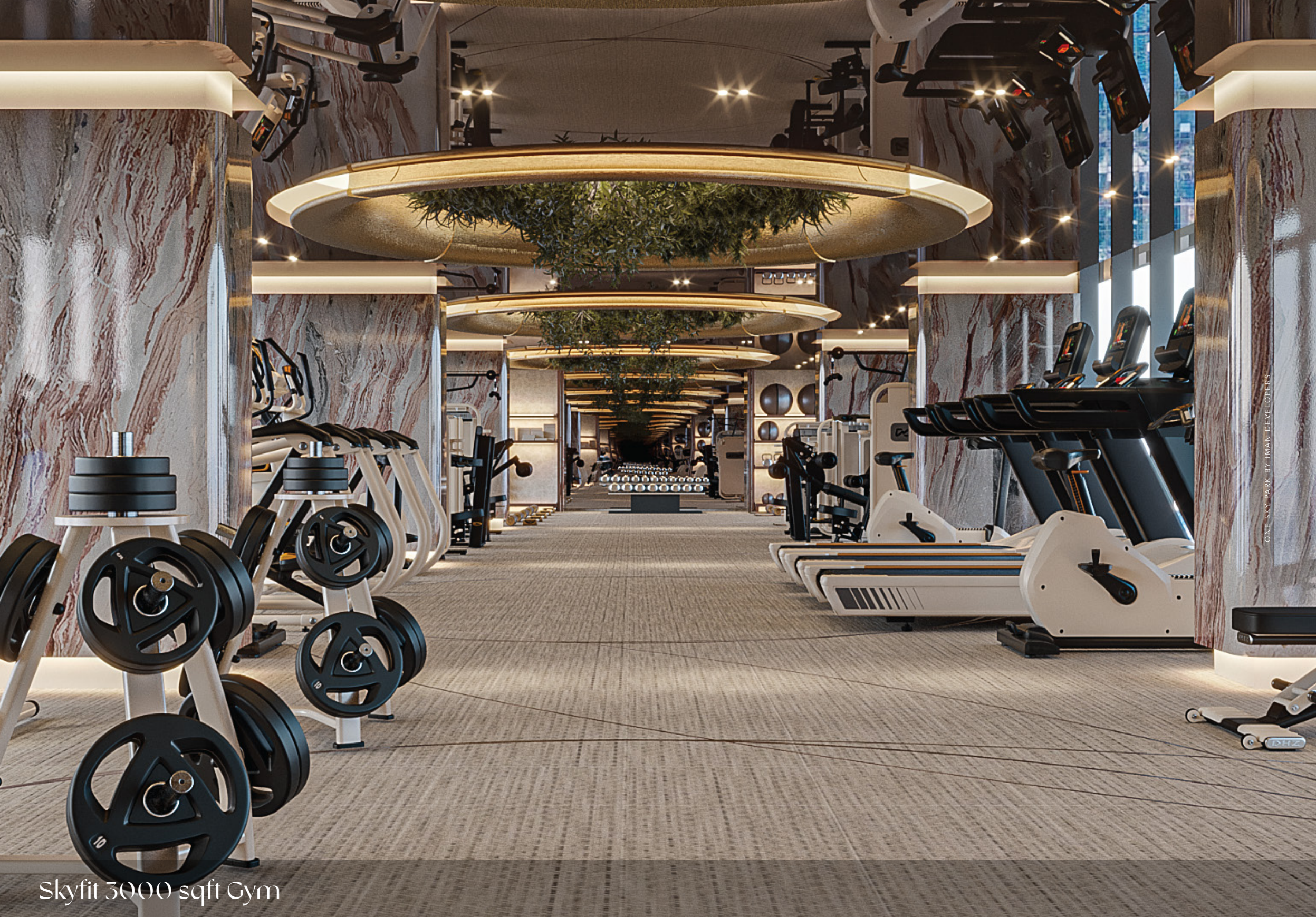
Skyfit 3000 sqft Gym