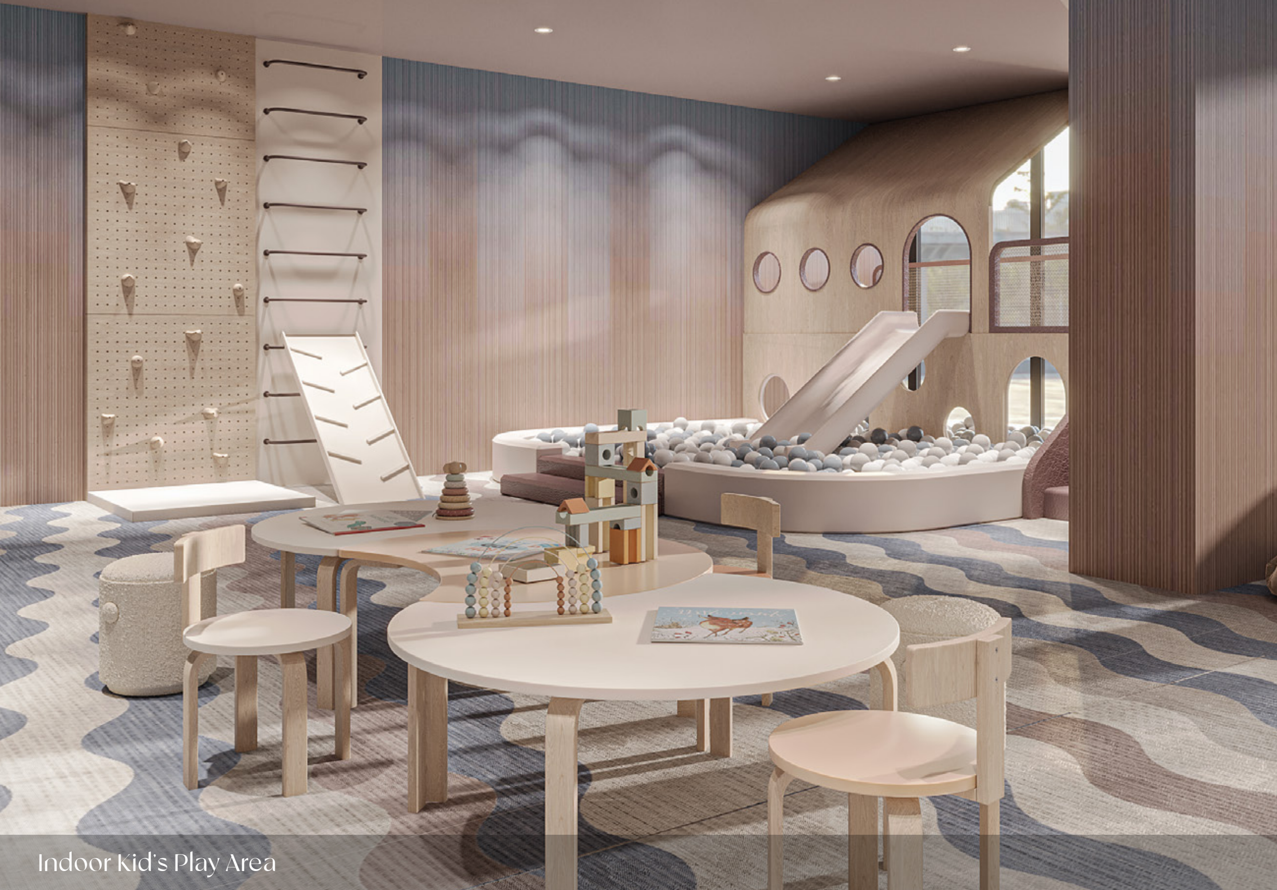
Indoor Kid's Play Area