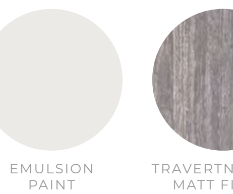
TRAVERTNO GREY MATT FINISH