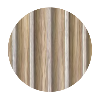
RIBBED WOOD PANEL LIGHT BEIGE