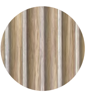
RIBBED WOOD PANEL LIGHT BEIGE