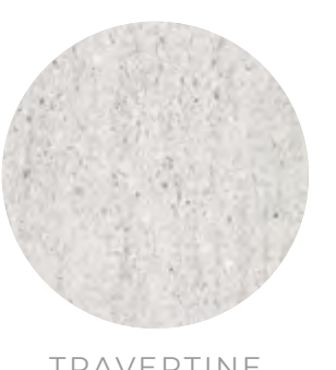
TRAVERTINE PORCELAIN SLAB LIGHT BEIG