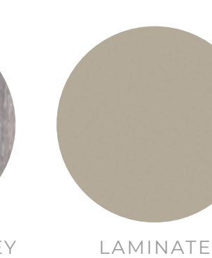
LAMINATE PEBBL GREY